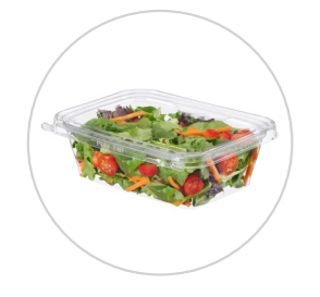
Fresher Longer Patented seal prolongs food freshness