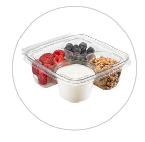
Enhanced Clarity Puts food center stage and increases impulse consumer purchases