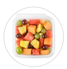
Leak Resistant Keeps product and its surroundings clean and dry